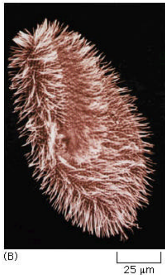
Figure 1. A scanning electron micrograph image of Paramecium . Paramecium is a ciliated protozoan covered with hairlike projections known as cilia. The cilia beat as a means of locomotion. Each cilia is a complete motile apparatus containing a complex arrangement of microtubules, linking proteins, and the motor protein known as ciliary dynein. These work together to bend the cilia.

Life responds to its immediate environment in order to enhance its survival. For example, plants move toward light and many grow upwards, away from gravity. Animals often make complex responses to environmental stimuli that include locating food, migrating to more suitable habitats, moving away from light, and seeking mates. Many organisms have developed a variety of sensory organs that allow them to discern significant environmental cues and respond accordingly. You are probably familiar with the ways macroscopic organisms sense their environment. They use their sensory organs to see, smell, hear, taste, or touch their environment. But how does a microscopic organism, one that doesn't have eyes or a nose or ears, sense its environment? In today's exercise we will look at whether a single celled organism, Paramecium (Figure 1), can respond to external stimuli such as food, light, magnetism, heat and so forth.